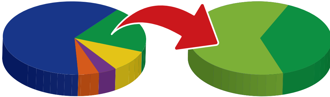
TOTAL BUDGET $222.4 MILLION

SARA's GENERAL FUND IS PRIMARILY SUPPORTED BY PROPERTY TAX REVENUE