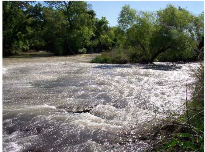
Conquista Crossing; Falls City, TX

tools by which the vision will be realized.