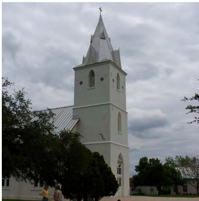
Nativity of Blessed Virgin Mary Catholic Church; Panna Maria, TX

Existing cultural, natural, and historic resources provide nodes and destinations throughout the area. Cultural centers provide local and regional users with the amenities and comforts they need, while the natural and historic resources draw users to destinations throughout the four-county system. Throughout the plan, the river is a focal area to be explored and celebrated.