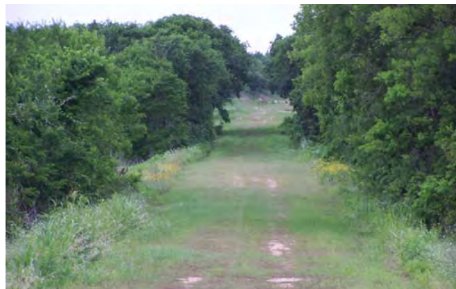
Abandoned Railroad Corridor; Floresville, TX

Individually, cities and counties may not be able to provide comprehensive parks and all the recreational resources their residents desire. Through partnerships, however, the pieces of this plan can become a reality for current and future generations.