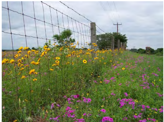
Jackson Nature Park; Wilson County, TX

Through its oversight and approval, the RPPAC has established a concept plan for the study area. This concept plan is the guide for creating an interconnected system of parks, trails, and natural areas. The concept presented in this document lays the groundwork for partnerships which can strengthen implementation strategies.