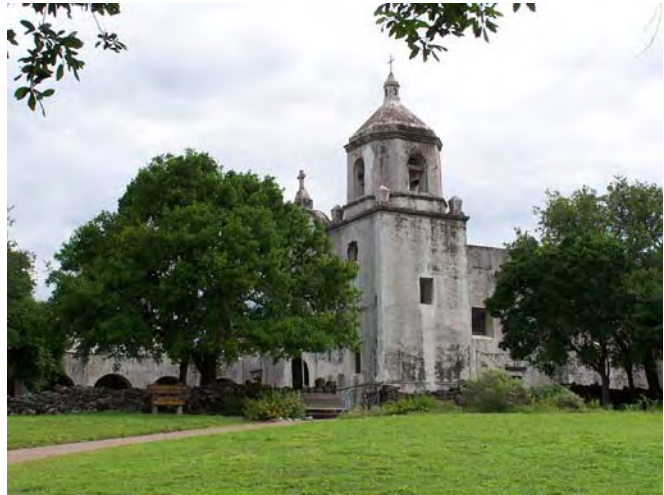
Mission Nuestra Señora del Espíritu Santo de Zuñiga; Goliad, TX; Credit: HNTB

Local projects may also be easier “wins” for the whole plan. Those “wins” may not be realized immediately in the region, but will be vital as the plan matures. This document gives the tools to assess and update a community’s situation: inventory of existing resources, analysis of the community needs, methods of prioritization and avenues of implementation. Existing and proposed projects can be evaluated by those tools to suggest a community’s direction, and better position them for partnerships and coordination.